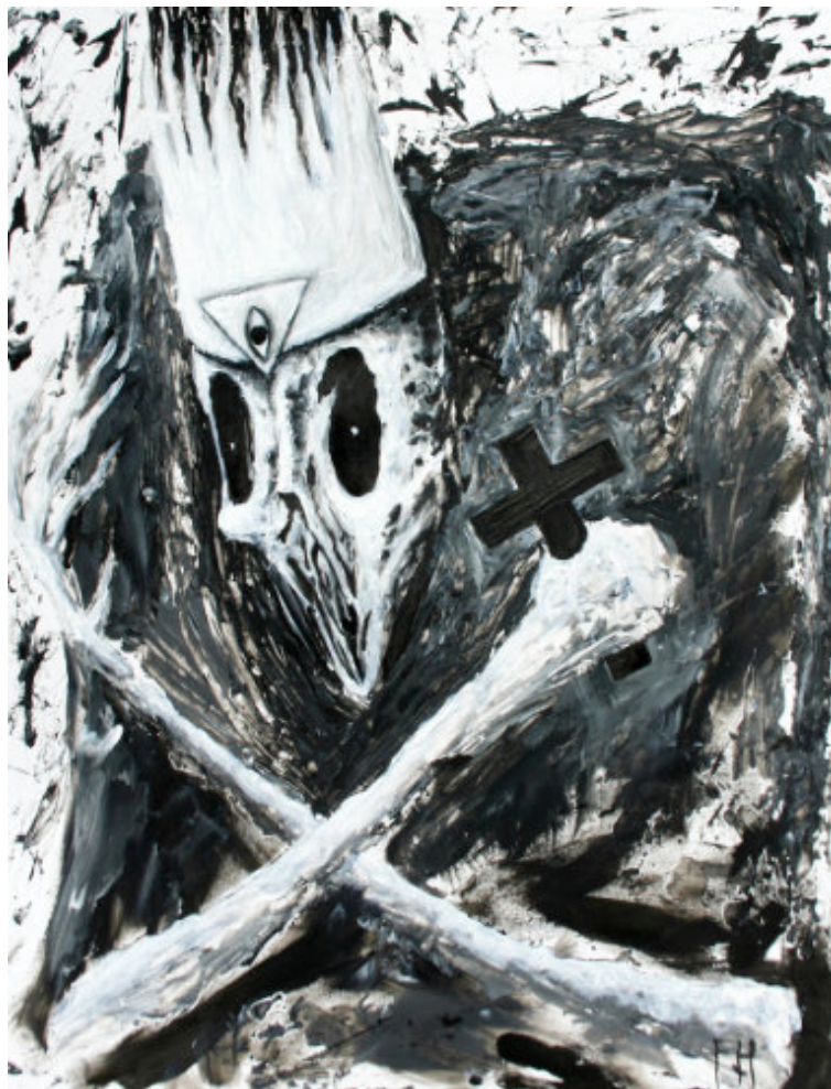
Artwork © Frank Heiler_Hail to the king