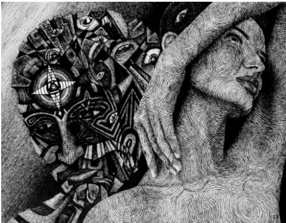
Artwork © Frank Heiler_Internal War