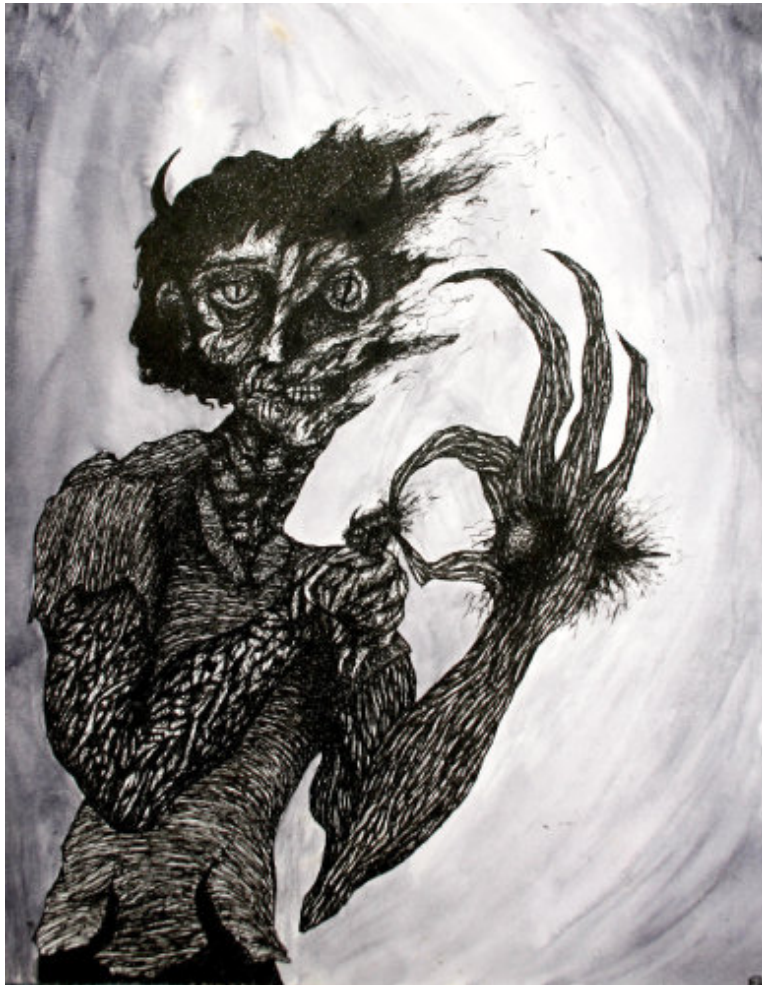
Artwork © Frank Heiler_Mutilation