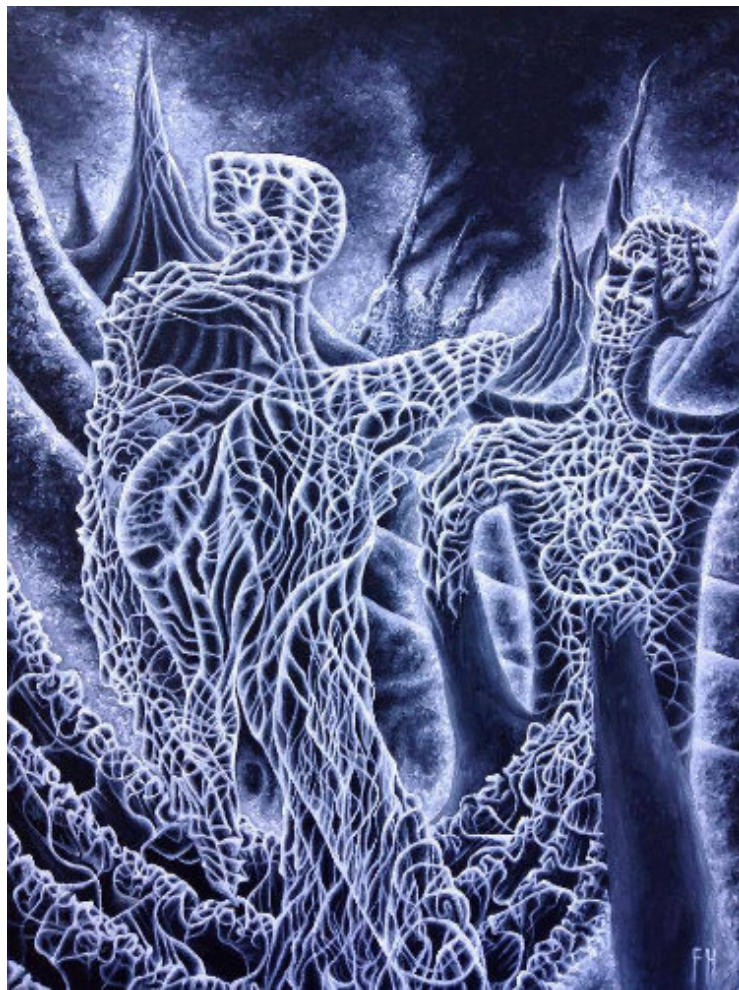
Artwork © Frank Heiler_The Fall of Reason