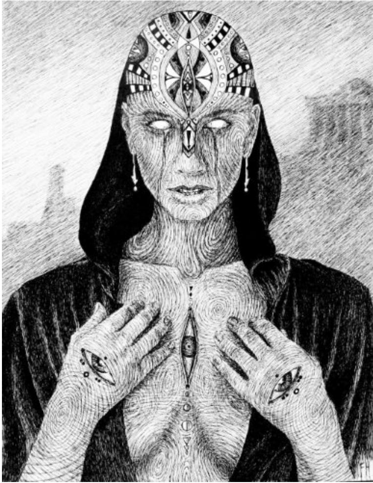
Artwork © Frank Heiler_Betrayal