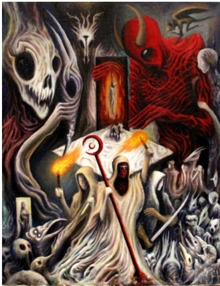
Artwork © Frank Heiler_A way out