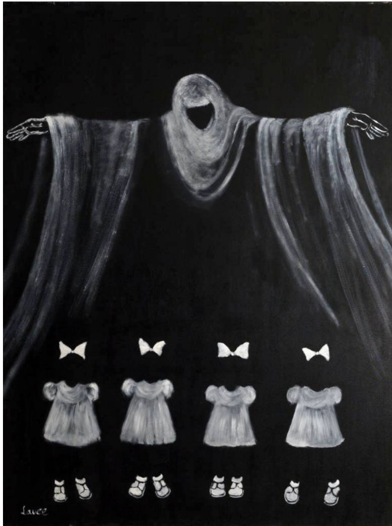
Artwork by © Miri Lavee_Who guards the little girls?