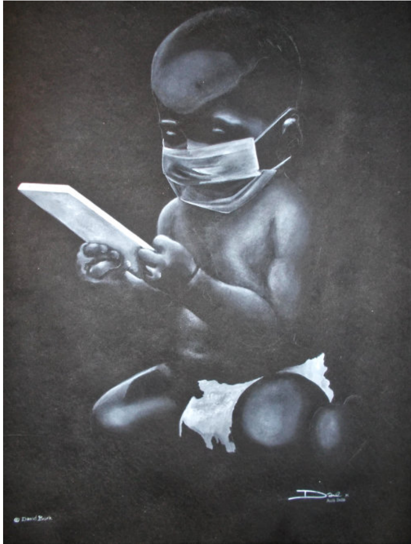
Artwork © Burksy2020_Child Abuse