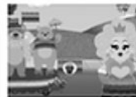
Propagandizing youth with LGBTQ+ media