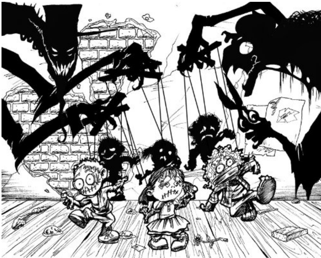
Artwork © The Jeb D_Teatro Sombras