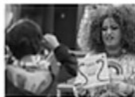
Drag & pride events involving children