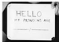
Queer & Gender Theory being taught in the classroom