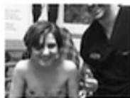
The mutilation & medicalization of minors